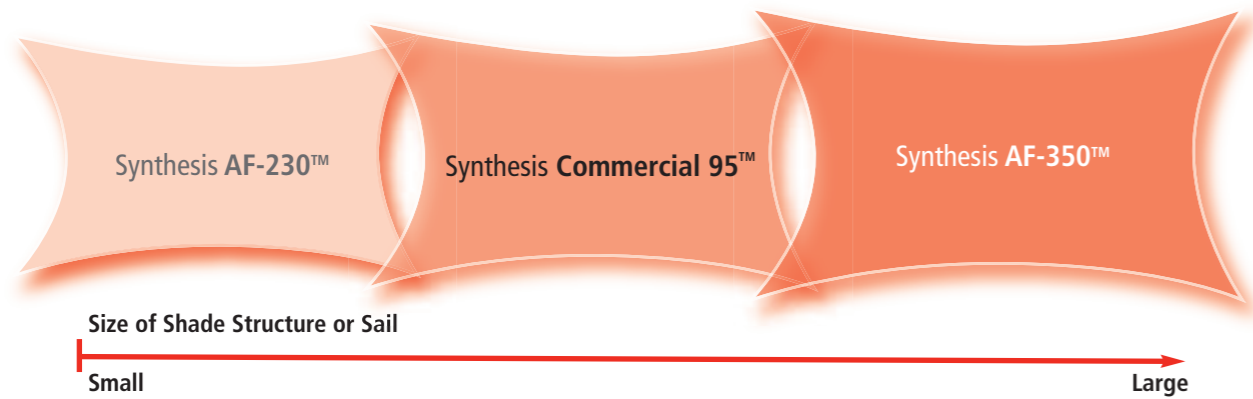
Synthesis Shade Structure Application Matrix

Synthesis architectural shade fabrics are engineered using time-proven monofilament and tape lock-stitch construction to ensure optimum performance regardless of installation conditions. The fabric won't deteriorate or fray, and the high-quality construction provides for long-lasting performance, superior UV protection and unmatched strength. And all carry our worldwide 10 year warranty against UV degradation.